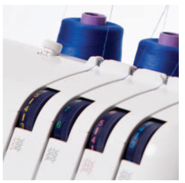
4 colour easy threading guide

The Brother 4234D hems seams perfectly and creates amazing decorative effects. With a 2, 3 or 4 thread overlocker you have great control, save valuable time and get great results.