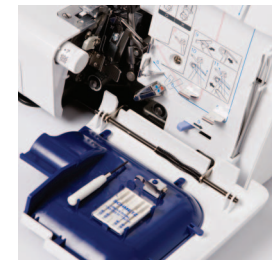
Built-in accessory storage