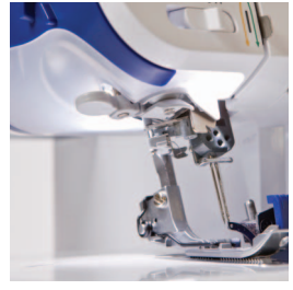
LED work light